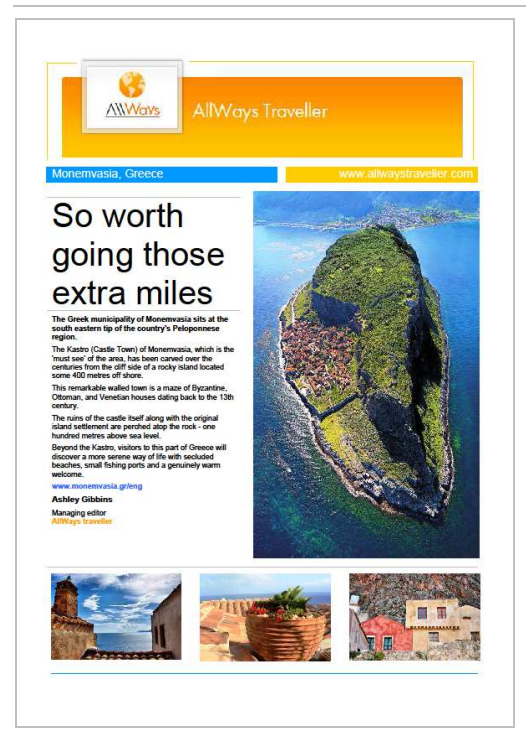
AllWays traveller to Monemvasia : www.allwaystraveller.com